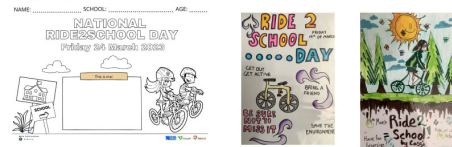
Example from: Neerigen Brook Primary School