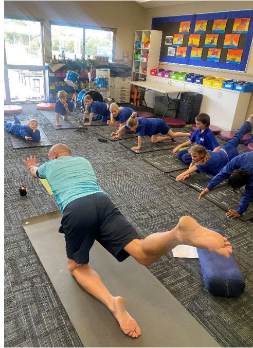
Yoga with Hoppy

WE WANT OUR PARENTS / CAREGIVERS / GUARDIANS TO TELL US WHAT THEY THINK!