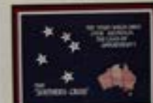
Propaganda recruiting to the British Empire Migration Program, 1914