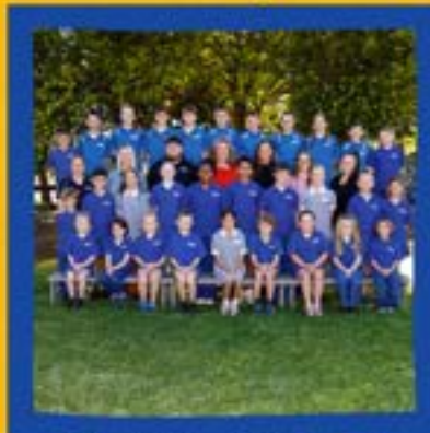
The Whole School