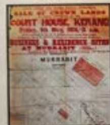
Auction of Murrabit township blocks, 24 May 1914