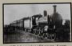
Official opening of Kerang - Goom Crossing Murrabit Railway, 20 December 1914 (Don Potter)